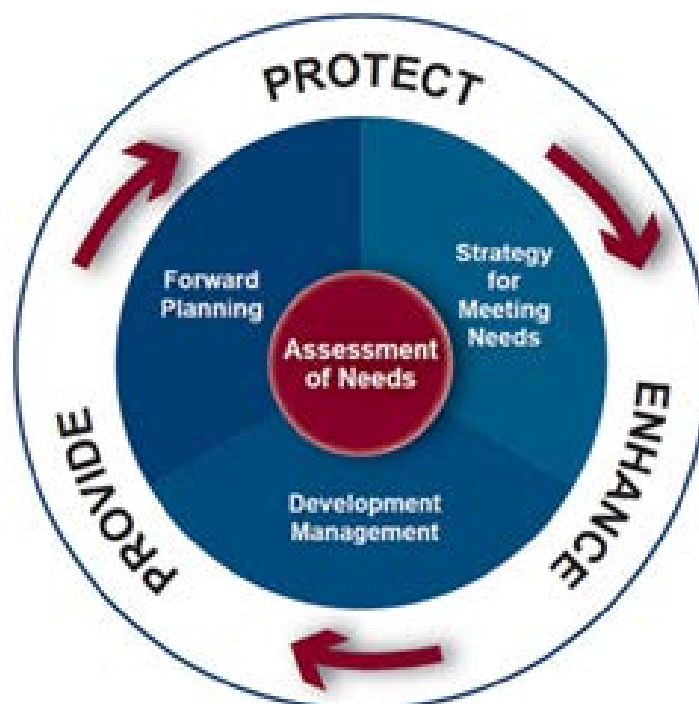
Figure 1: Planning objectives - Protect, Enhance and Provide

Aim 3 - To provide new playing pitches where there is current or future demand to do so.