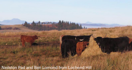
Neilston Pad and Ben Lomond from Lochend Hill