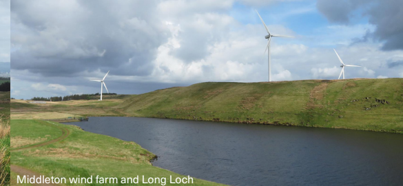
Middleton wind farm and Long Loch