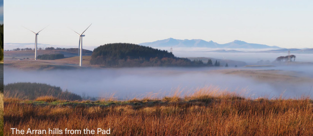
The Arran hills from the Pad