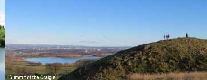
Summit of the Craigie